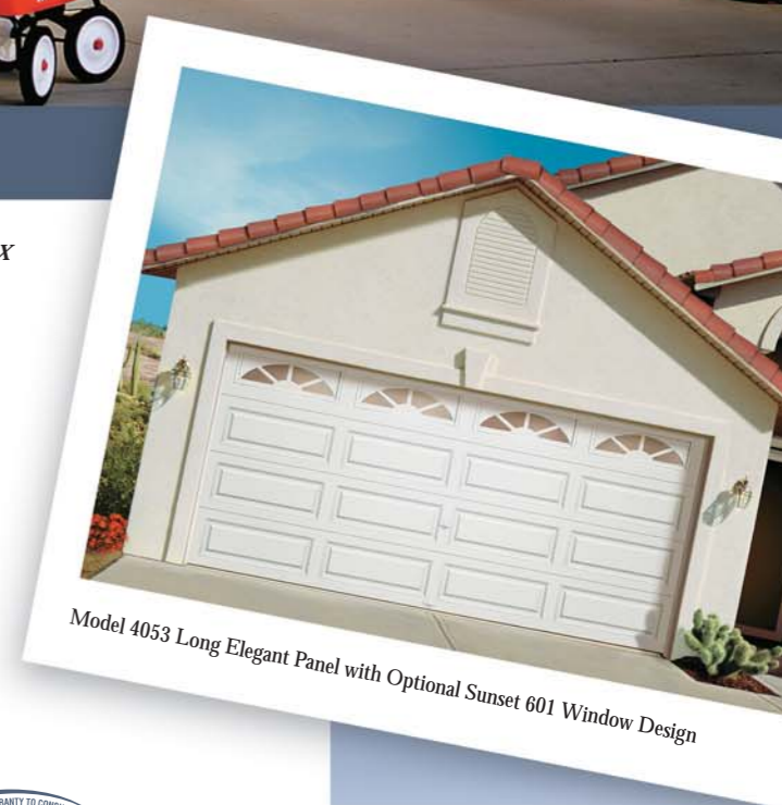
Model 4053 Long Elegant Panel with Optional Sunset 601 Window Design