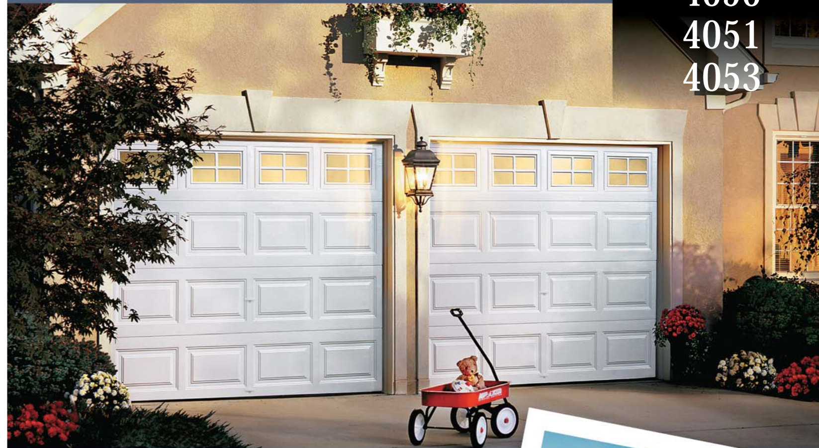
Model 4050 Short Elegant Panel with Optional Colonial 509 Window Design

With a three layer construction and three beautiful panel designs in six color options, the Models 4050, 4051, and 4053 Series doors are the right choice for your home's design. The Premium Series' 3-layer construction provides exceptional strength, insulation, dent resistance and security, as well as uncommonly quiet operation and a beautiful appearance outside and inside. No other manufacturer offers more styles, colors and windows than Clopay.